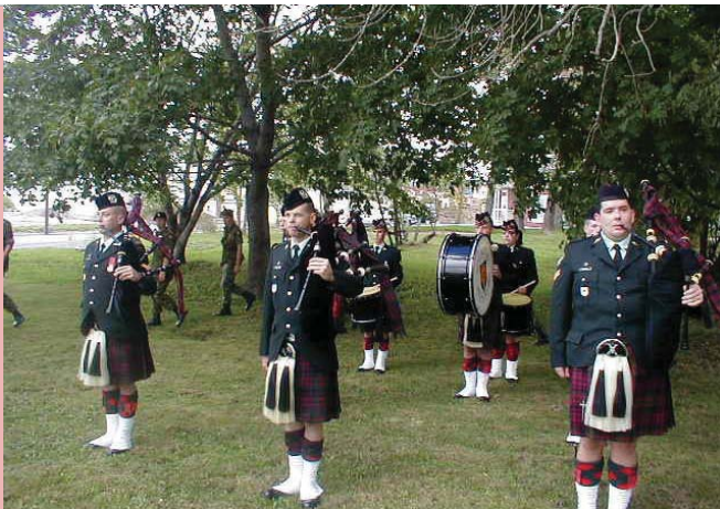
Pipes and Drums of 2nd Battalion, The Nova Scotia Highlanders(Cape Breton).