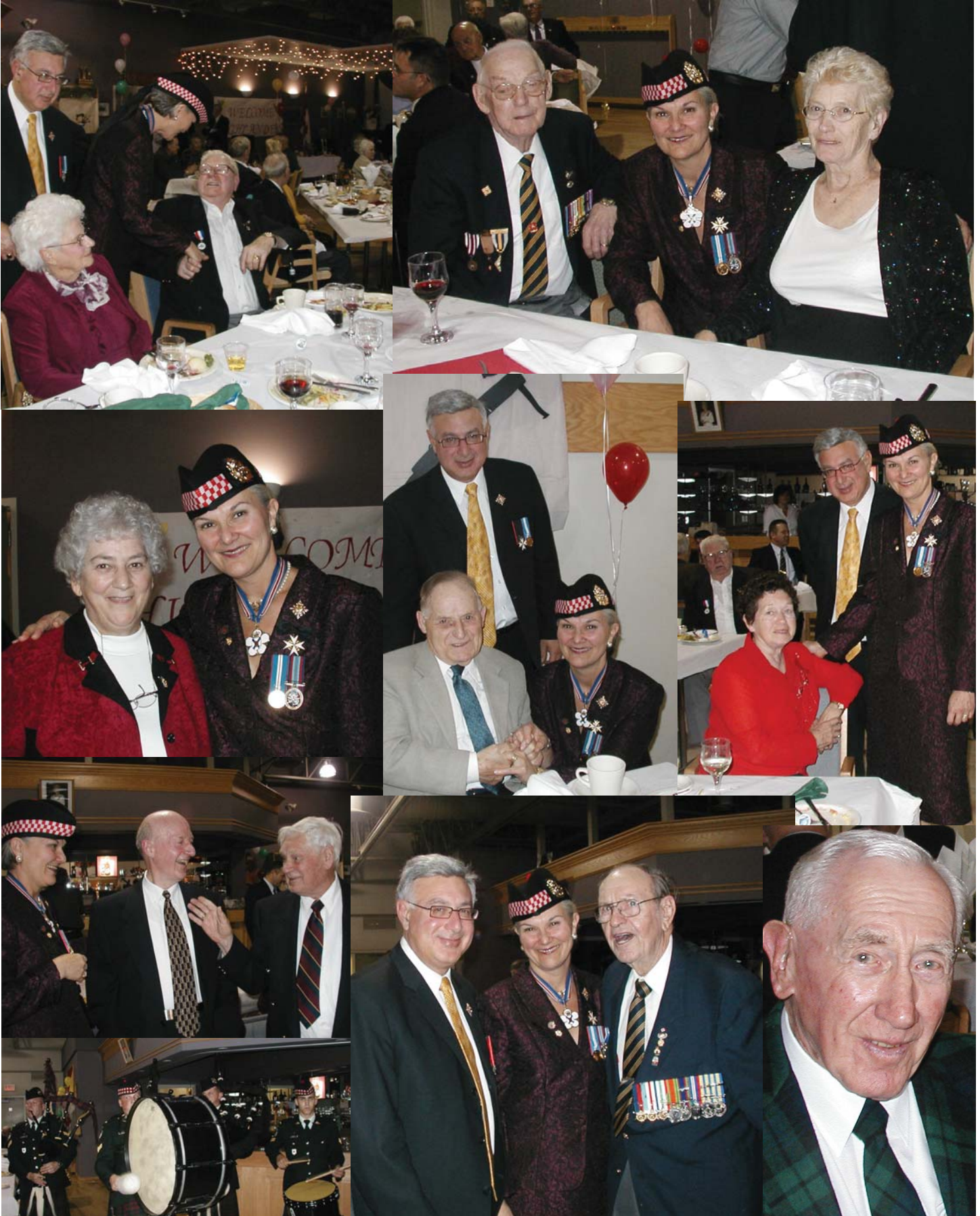
Photo gallery of Her Honour, Myra Freeman, ONS, Lieutenant Governor of Nova Scotia and her husband mingling at the 36th Annual Reunion and some friendly faces.