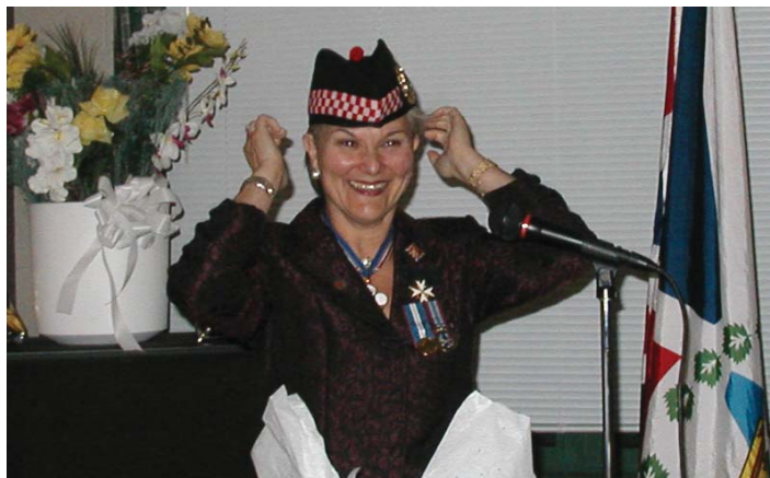
"Her Honour trying on her CBH Glengarry."